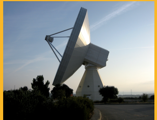
Radio telescope in the Yebes Observatory (Guadalajara)

Thanks to the European project NEXPreS, the robustness of traditional VLBI has been enhanced by the speed and flexibility of the new electronic VLBI (e-VLBI), where data can also be correlated in real time. As added value, e-VLBI provides significant time savings and the ability to observe short-lived astronomical events such as supernova explosions or gamma-ray bursts.